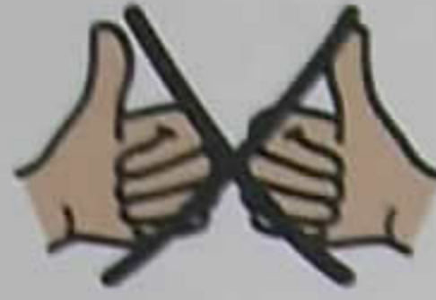
is not a good